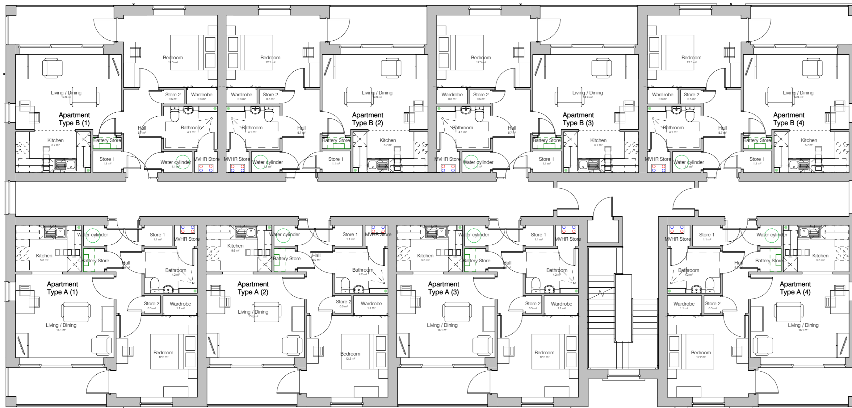
First Floor Plan 1:100