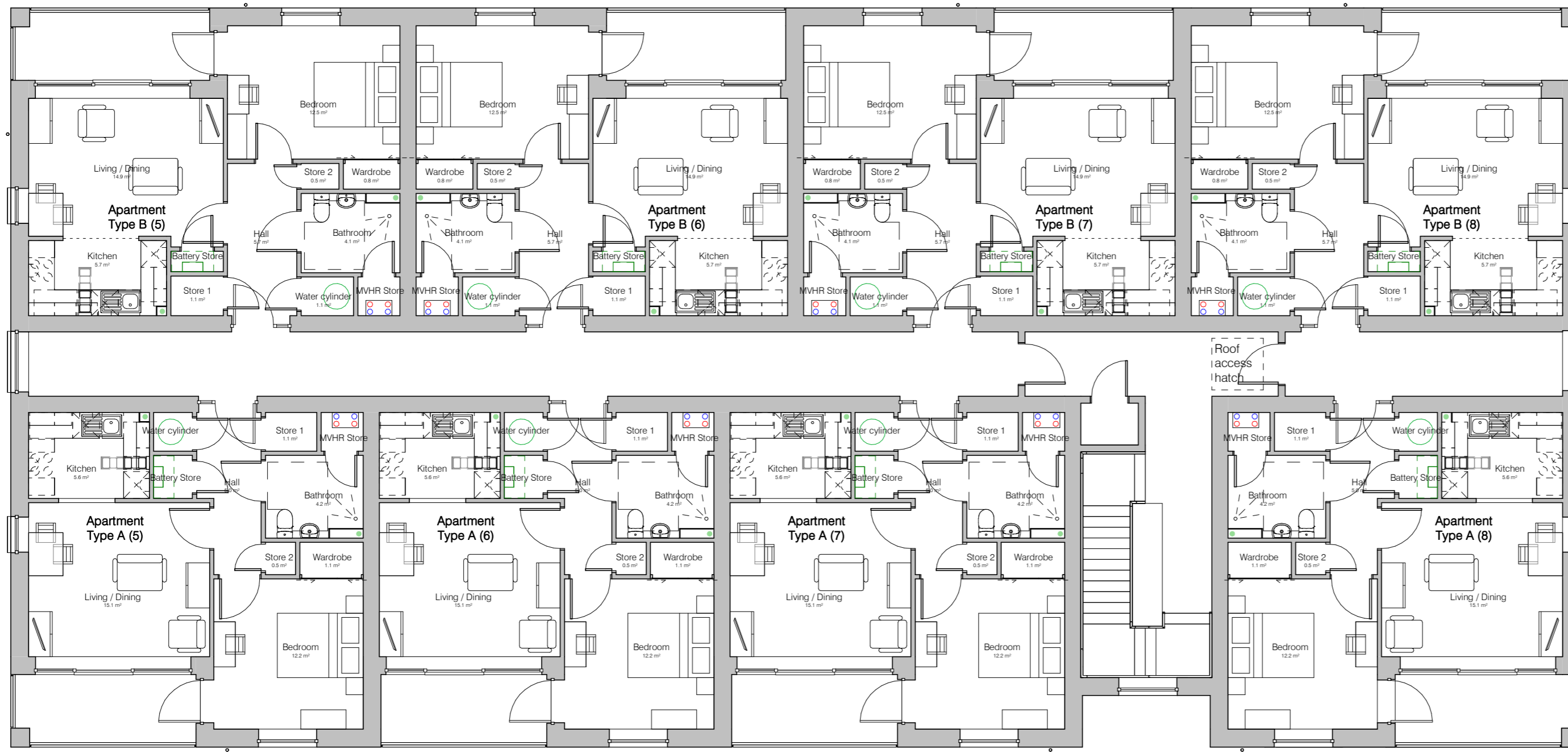
Second Floor Plan 1:100