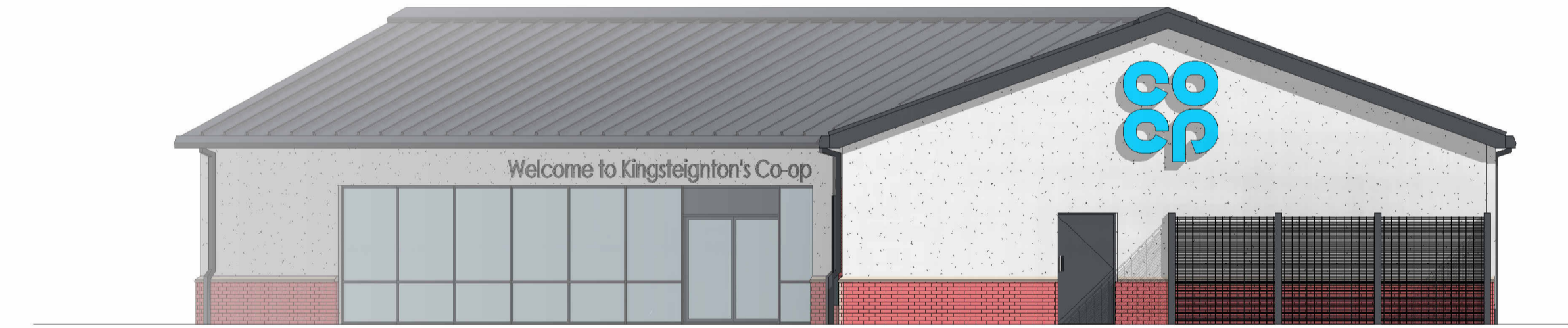
View No. 02 Western elevation 1:100