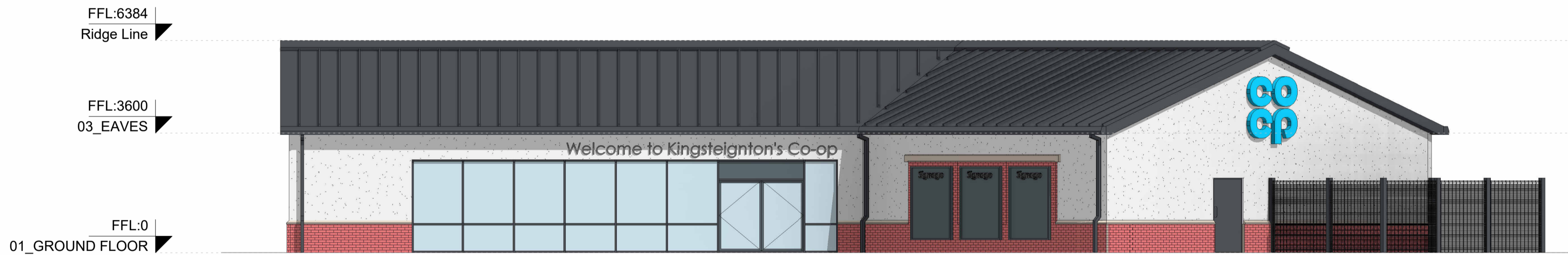
View No. 03 Principle elevation - NW 1:100